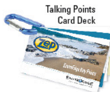
Talking Points Card Deck