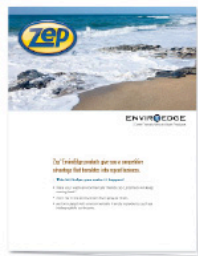
Training Kit Overview

The training and professional marketing tools are designed to help your employees communicate effectively that your wash is environmentally friendly through the use of EnviroEdge Earth-Friendly Vehicle Wash Products.