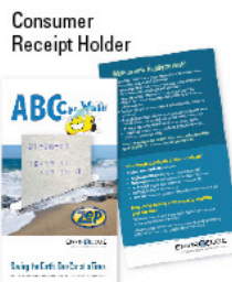
Consumer Receipt Holder